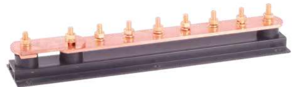
Earth Bar – Single (S-type)