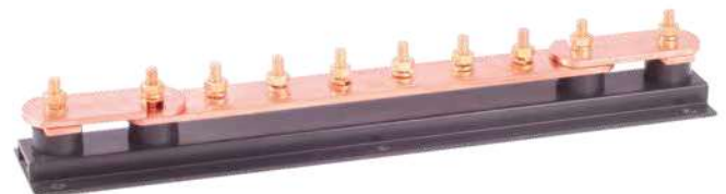
Earth Bar – Twin (T-type)